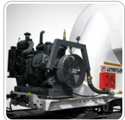
OPTIONALLY ELECTRICAL DIESEL COMPRESSOR