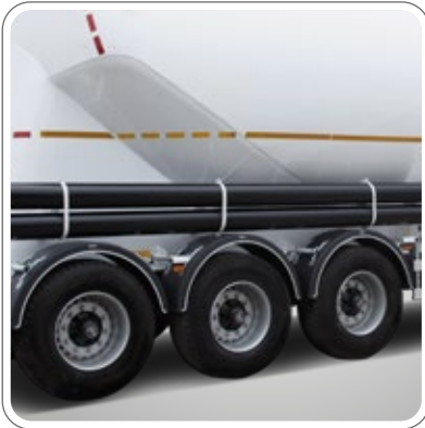
3x9 TON CAPACITY AXLE