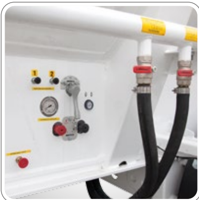
W CONICAL DISCHARGE SYSTEM 20-25 min.