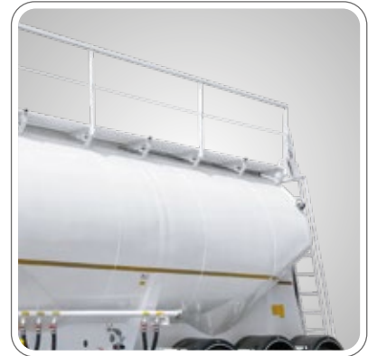
PNEUMATICAL OR MECHANICAL OPENING GUARDS