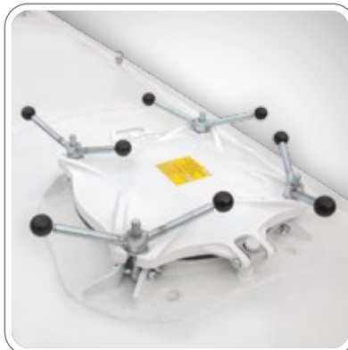
MANHOLE COVER WITH SVIVEL JOINTS